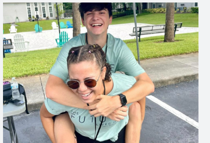
Northgate Lakes — Oviedo, FL