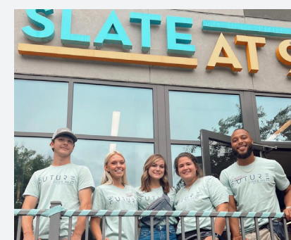
Slate at 901 – Knoxville, TN