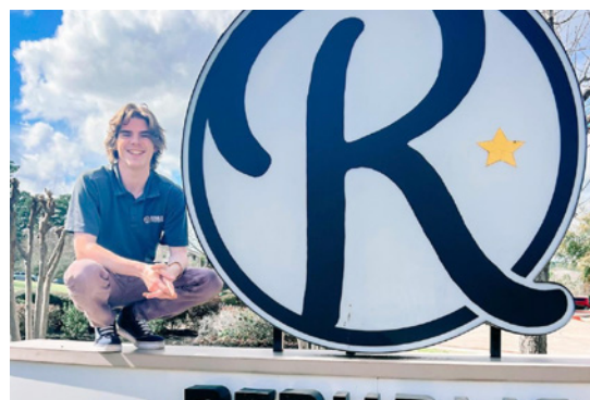
REPUBLIC AT SAM HOUSTON