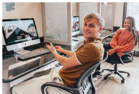
FORUM AT DENTON