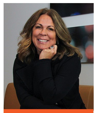
"Whatever it is you do, whatever messaging you're getting out there, be authentic to who you are."